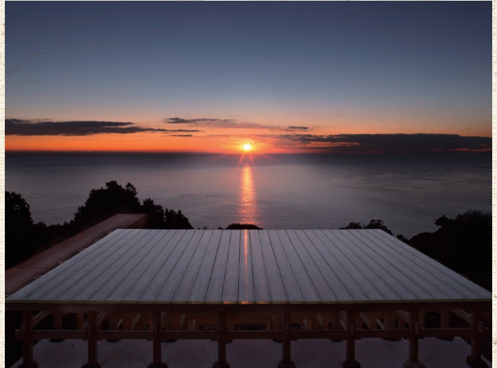
Winter Solstice Observation Tunnel and Optical Glass Stage at Enoura Observatory (Reservation required through www.odawara-af.com/en/enoura/ )

7minutes from Odawara Station by JR Tokaido Line