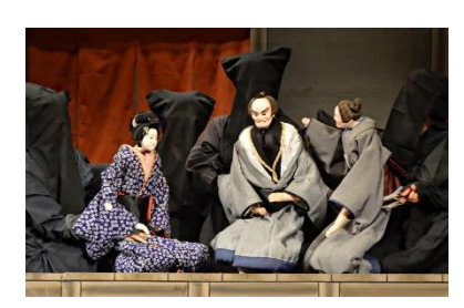
Hanbei tied to a rope

"Osono no Kudoki" that still longs for not becoming aware at all husband that without returning one at the storefront is the highlight. We sit straight and lean neck to one side, and gesture of Osono that became some forward bending expresses sad thought of pretty daughter. In addition, even sex appeal of woman was puppet master who felt without breaking knee in dancing posture a little, and I thinking with daughter that gesture to put hand with sleeve on top of one another was young at all.