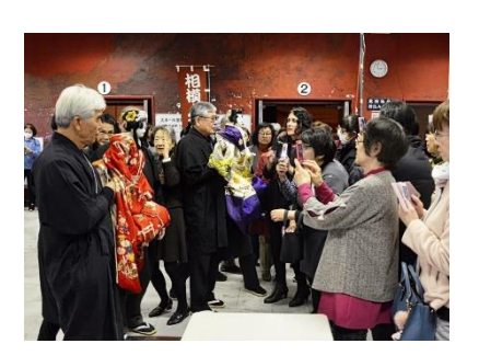
Touch dolls close to you

There were many troupe of puppet play once in various parts of Japan. Puppet play of village prepared for puppet and the stage in the villager and we continued taking a lesson of puppet operation and the talk, shamisen and staged in front of villagers. Puppet play was villagers' familiar entertainment that we built up together and enjoyed. Even if we read history of Shimonaka-Za and saw, "Wakashuyado" took the succession. By sympathizing with feeling of person