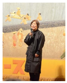
Before the start of Chairperson Hayashi

While three people of mole (kuroko) "puppet master" manipulate puppet, greetings puppet play plays story, but high technique is demanded from puppet master. Puppet and ability that does not let you feel are sought all too soon by person watching. Each puppet troupe of Sagami-Ningyo-Shibai is not professional. Even if it is amateur, it is worked hard to act that "puppet is more human than human being" and can see by everyday severe training.