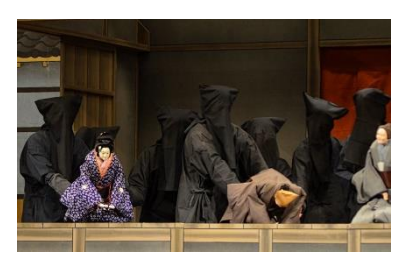
Lowering head Sogan and Osono

When the three of them retracted to talk about the future, Osono, who was left alone, "Imagoro ha Hansichi san, dokodedoushitegozarouzo", "kyonen no natsuno wazuraini isso sindesimoutara koushita nangiha senumonowo", and show of painful chest. It is famous lines called "Osono no Kudoki". It is chance for puppet master to show what he/she can do how you play Osono that became alone.