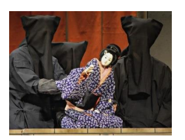
The gesture of Osono