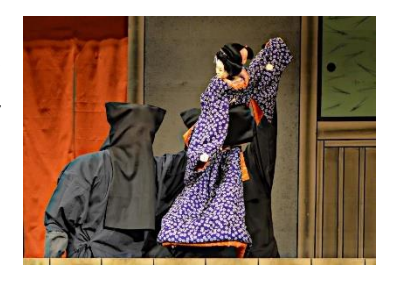
Looking back on Osono's standing

Puppet play has many stories about "feeling" such as love and parent and child or couple of man and woman whom way does not become. As for the genre called "drama of contemporary life", daily life of public people is background. It is sacrifice to repay pledge with consideration of couple, failure of business and harlot of red light district, tangle and favor of parent and child. In addition, it was theme that was important to loyalty to lord. In the story that became the